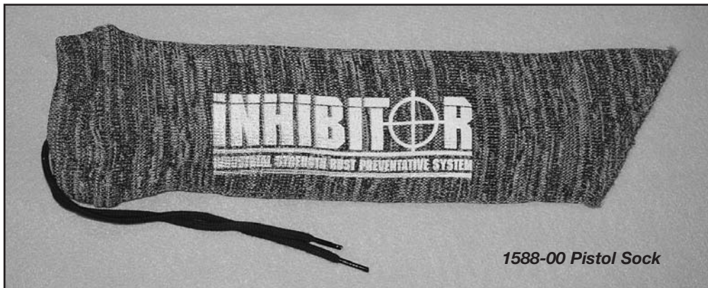
1588-00 Pistol Sock

The Inhibitor Rust Preventative System encompasses a full line of products to stop rust and corrosion. Our military grade VAPOR TECHNOLOGY in all of our products protects the areas that you do not. Be sure to use all of the products as a complete system to provide the ultimate in protection from rust and corrosion.